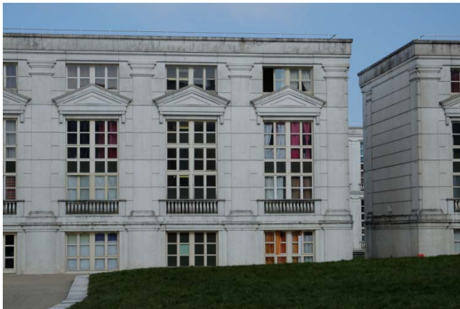
Sergy-Pontoise, 2016