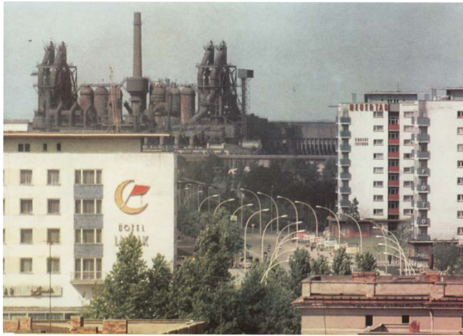
Eisenhüttenstadt, 1965